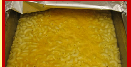
Macaroni & Cheese