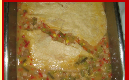
Chicken Pot Pie