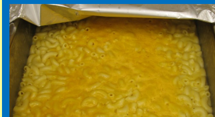
Macaroni & Cheese

What foods are served with a 6 oz Spoodle?