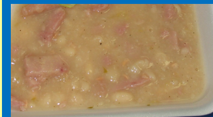
Ham & White Beans