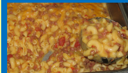
Casseroles like Italian Mac