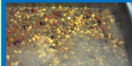
Soups like Taco Soup