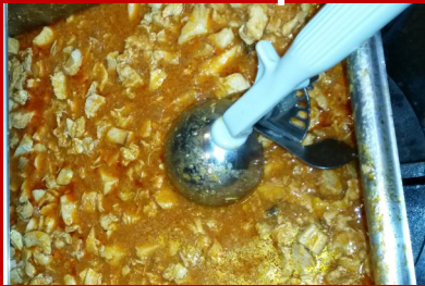
Taco Meat (Chicken or Beef)