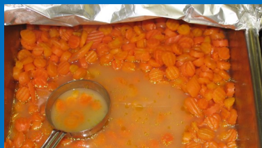
Carrots and other Veggies