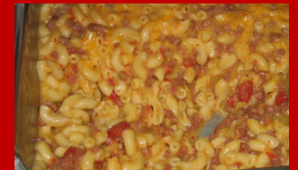
Casseroles like Italian Mac